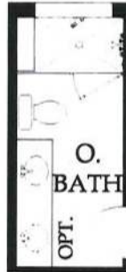
Walk-In Shower Option @ Owner's Bath

Personalize your home design. Visit delwebb.com/lakewoodranch to access our interactive floor plan tool.