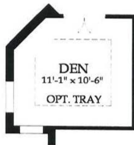
Opt. Den ILO Flex