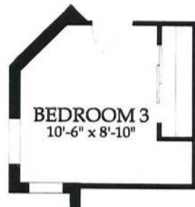
Opt. Bedroom 3 ILO Flex